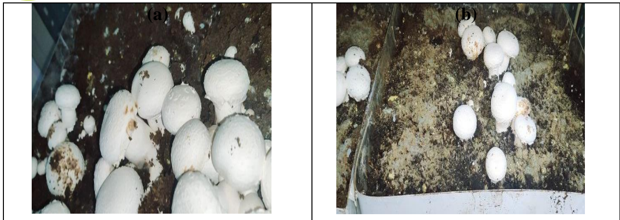
Figure (4) Productivity of the edible mushroom A.bisporus (a)with the treatment Pathogen + Biocidal + Extracts (b) with the presence of pathogenic A. flavus