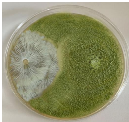
Figure (2): Isolate A. flavus B1 inhibitory the growth of fungal hyphae of A. bisporus