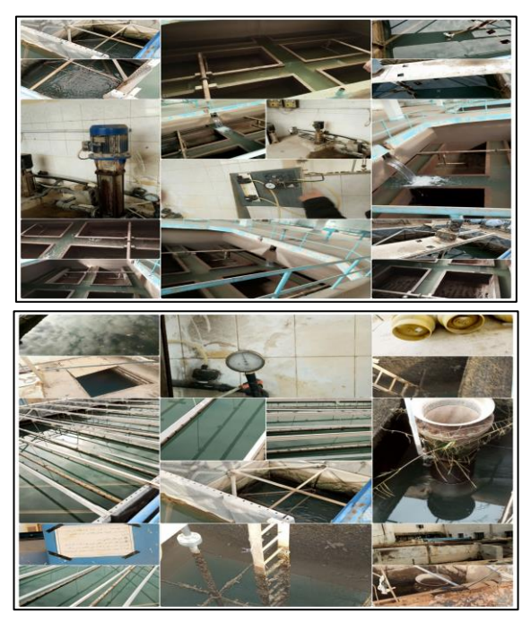
Figure 2. Pictures explains the steps for removing heavy metals from wastewater in the water purification center in Karbala city.